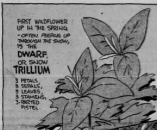
FIRST WILDFLOWER UP IN THE SPRING OF THE FLOWERS THROUGH THE SHOW, IS THE DWARF OR SNAJOW TRILLIUM 3 PETALS, 3 SEEDS, 3 STAMENS, 3-BRETTED PISTIL.

THIRTY ACRES OF WILD BEAUTY, SO SECLUDED YOU'LL THINK YOU ARE WAY OFF FROM MINNEAPOLIS. THERE ARE SOME 200 SPECIES OF BIRDS AND MORE THAN 1000 LITTLE MINNEAPOLIS WILD FLOWERS, IN ADDITION TO MOSES, ALGAE AND FUNGI.