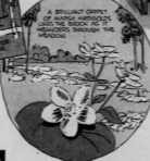
A BRILLIANT CARPET OF MARCH MARIGOLDS LINES THE BROOK AS IT MEANDERS THROUGH THE MEADOW.