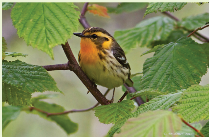
The Cape May warbler (above) and the blackburnian warbler (below) pass through in small numbers on their way to nesting grounds in the boreal forest to the north.

Once you are familiar with the yellow-rumped warbler, you can compare it to other warblers. The magnolia warbler (top) also has a yellow rump and the breeding male has the striking dark mask and white wing bars. But unlike the yellow-rump, the magnolia warbler has a bright yellow underside with dark streaks. Unlike most warblers that are just passing through, the yellow warbler (middle) and the American Redstart (bottom) often nest in the Twin Cities area, usually near wetlands.