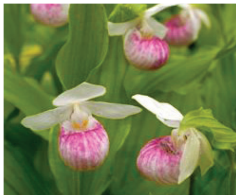
Above – Virginia bluebells; Top Right – Interrupted fern; Bottom Right – Showy lady's slipper