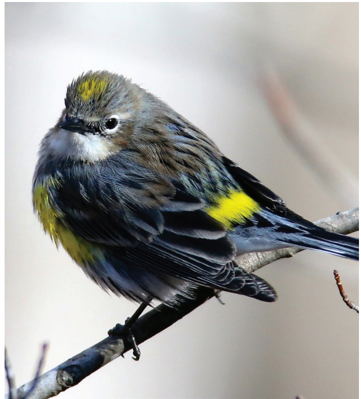
On the left is a male yellow-rumped warbler in his finest breeding plumage. Note the yellow on the rump, sides and crown. The breeding male also has a striking dark mask and white wingbars. The underside is mostly white with dark streaks. Female and juvenile yellow-rumps (right) have similar features but are more subdued in plumage.