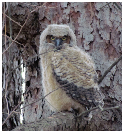
One of several great-horned owllets that were spotted in the Garden this spring.

At the Garden, summer's warm weather brings a fairly steady stream of visitors, many family groups and quite a few out-of-towners. It's a busy time in the Martha Crone Shelter, and our volunteers play an important role in welcoming everyone and orienting visitors to the Garden's many treasures. The naturalists conduct a wide variety of programs, and I encourage you to check out their offerings on the Minneapolis Park and Recreation Board's website. Go to www.minneapolisparcs.org/ebwg , and scroll down to the summer program brochure. There you'll find wildflower walks, tours geared to families, birding programs, nature hikes and much more. Most programs are free, but there are some special ones with fees. Program descriptions, schedules and all the information you need to sign up are provided.