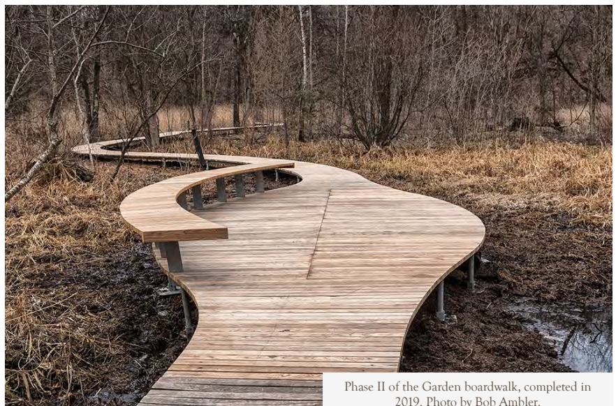
Phase II of the Garden boardwalk, completed in 2019.