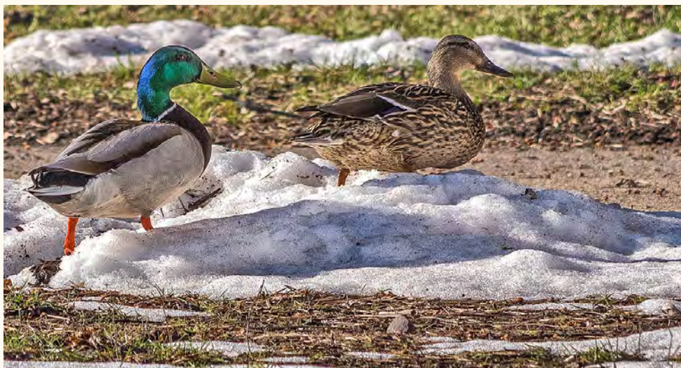
Mallards making the rounds of the Garden territory on a spring thaw day. Photo by Bob Ambler

Left: A fragrant harbinger of warmer days, the wild plum graces the upland garden with its delicate blooms. Photo by Bob Ambler