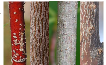
Bark of (l to r) Red Osier, Silky, Gray and Pagoda Dogwood