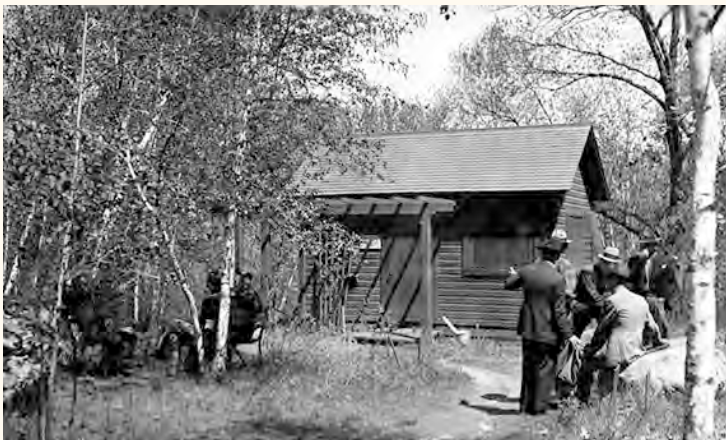
Wildflower Garden office designed in 1915 by Eloise Butler. Photo ca 1935, courtesy Martha Crone Collection, MN Historical Society