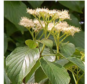
Upright flower clusters of Pagoda Dogwood

but thinning the suckers when young will produce a small tree. The names tell you a lot. It looks like a pagoda shape with the branches horizontal in tiers of decreasing width holding glossy alternate placed leaves ( alternifolia ) in tufts at the end of twigs.