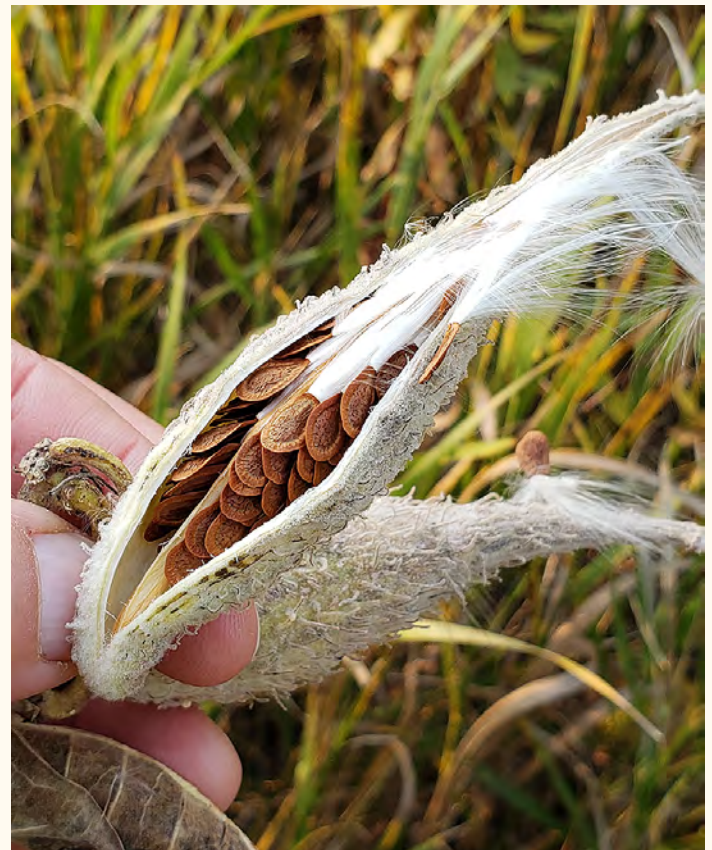
A milkweed pod at just the right moment for easy seed collection

Whether you decide to hunt your own seeds or leave it to the pros, you can appreciate the hard work and dedication that goes into native seed collecting. Our local plant community thrives because of these efforts and we all reap the benefits.❖