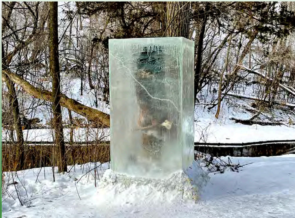
The mysterious ice man Zug Zug was found near Theodore Wirth parkway. Hopefully you saw him before the snow melted.