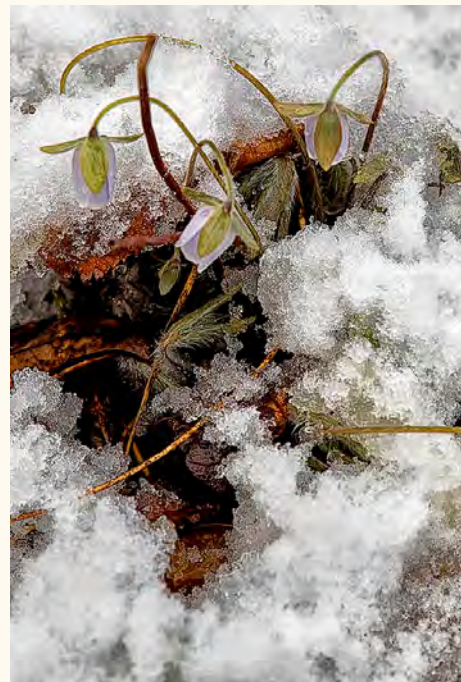
Opportunistic hepatica make the most of warmer days, even with snow still on the ground.

www.facebook.com/ebwgmpls www.instagram.com/ebwgmpls