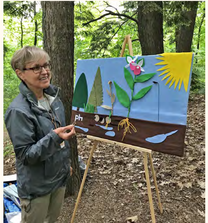
Our new president teaching about everything required for a Lady Slipper to grow.