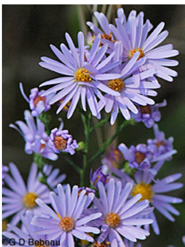
Smooth Aster ( Symphyotrichum laeve ).