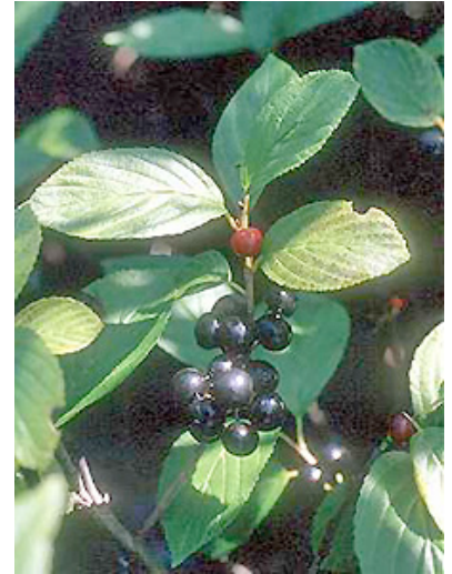
Alderleaf Buckthorn ( Rhamnus alnifolia )