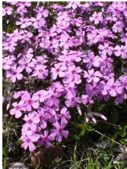
Moss Phlox ( Phlox subulata )