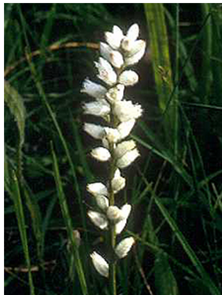
White Colicroot ( Alettris farinosa )