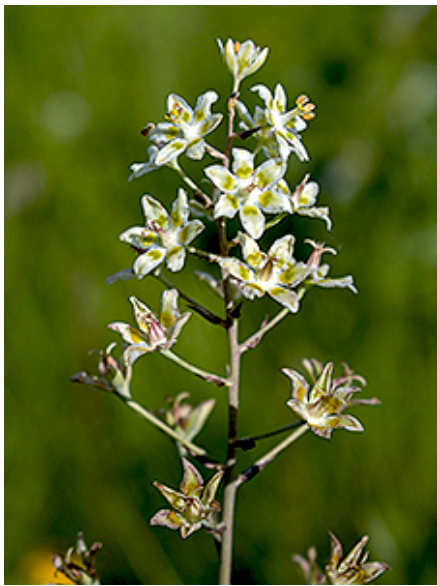
White Camas , ( Zigadenus elegans ).