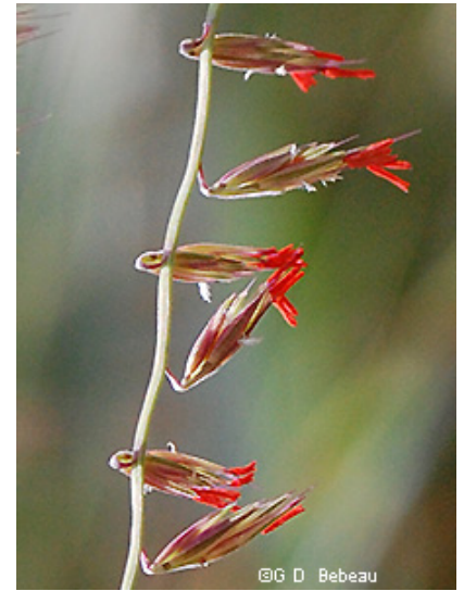
Sideoats Grama ( Bouteloua curtipendula ).