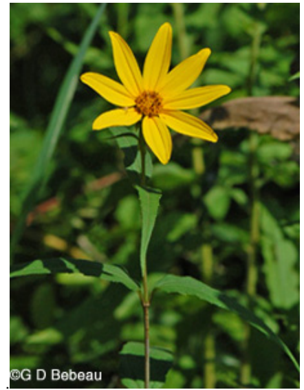
Paleleaf Sunflower ( Helianthus strumosus )