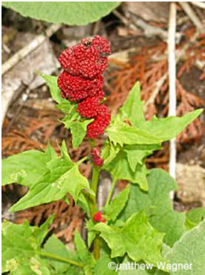
Strawberry Blite ( Chenopodium capitatum ).