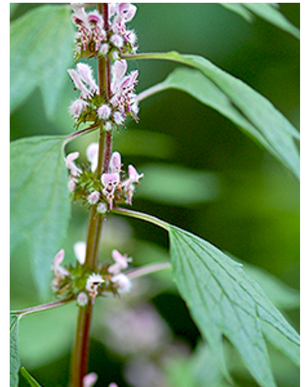
Common Motherwort ( Leonurus cardiaca ).