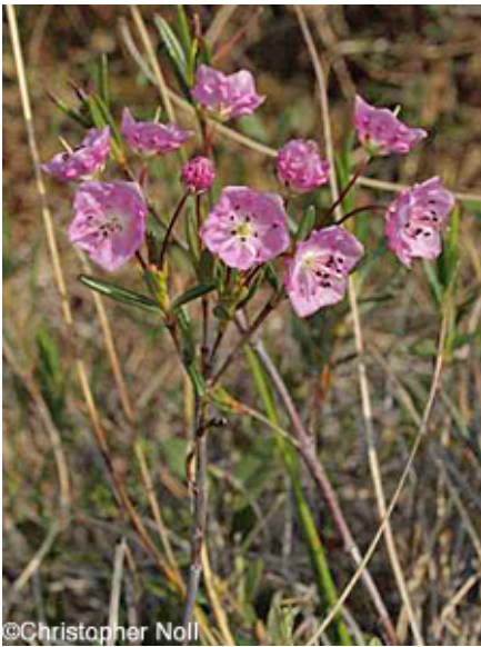
Bog Laurel ( Kalmia polifolia)