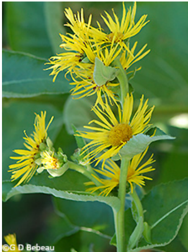
Elecampane inula ( Inula helenium ).