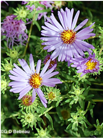
Aromatic Aster ( Symphyotrichum oblongifolium ).