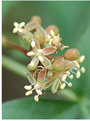
Virginia Creeper ( Parthenocissus quinquefolia).