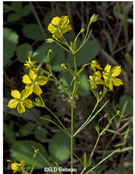
Fourflower Yellow Loosestrife ( Lysimachia quadriflora )