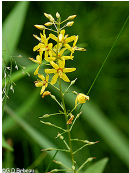
Yellow loosestrife - Swamp candles ( Lysimachia terrestris ).