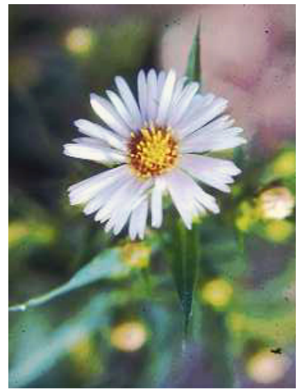
Boltonia or White Doll's Daisy ( Boltonia asteroides).