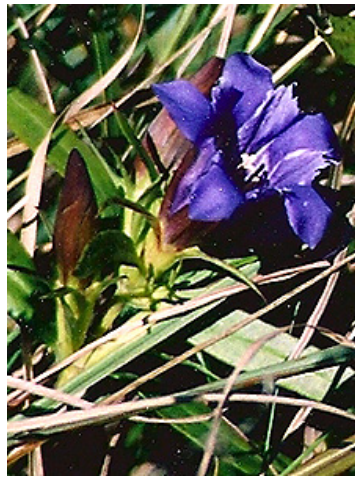
Downy Gentian ( Gentiana puberulenta ).