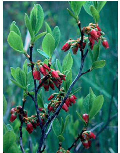
Black Huckelberry, ( Gaylussacia baccata ).