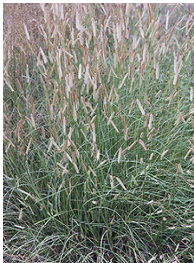
Blue Gramma ( Bouteloua oligostachya ).