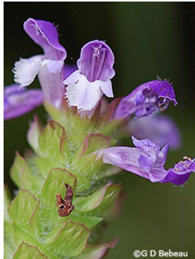
Selfheal (Heal-all) ( Prunella vulgaris ).