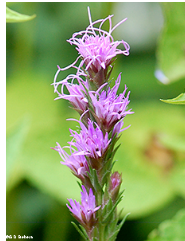
Dotted Blazing Star ( Liatris punctata ).