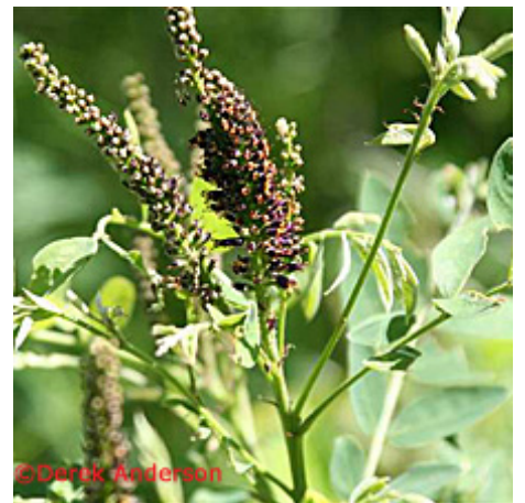
Desert False Indigo, ( Amorpha fruticosa)