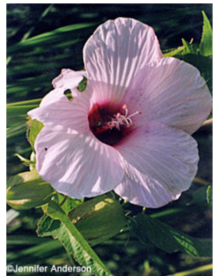
Halberdleaf Rosemallow ( Hibiscus laevis)