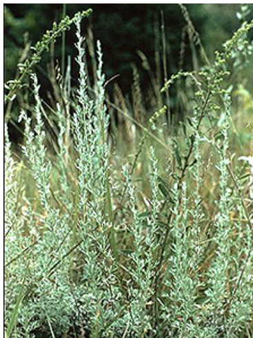
Prairie Sagewort ( Artemisia frigida).