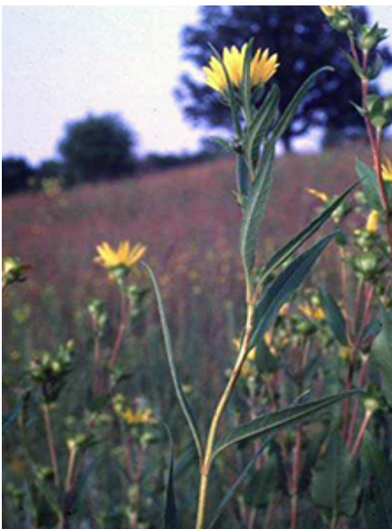
Maximilian Sunflower ( Helianthus maximiliani)