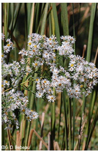
White Panicked Aster ( Symphyotrichum lanceolatum ssp. lanceolatum ).