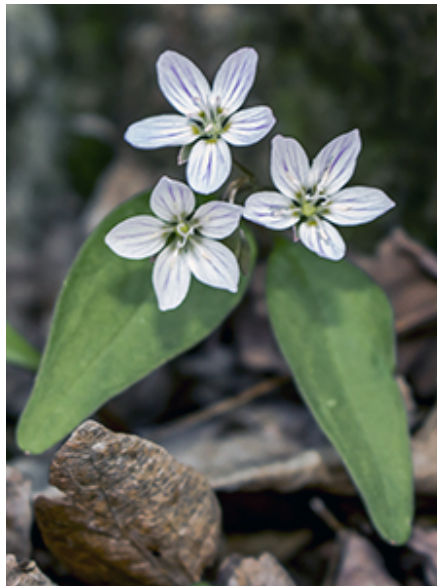
Carolina Spring Beauty ( Claytonia caroliniana)