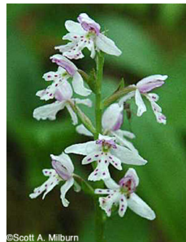
Round-leaved Orchid ( Amerorchis rotundifolia).