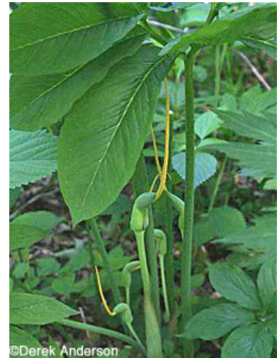
Green Dragon ( Arisaema dracontium).