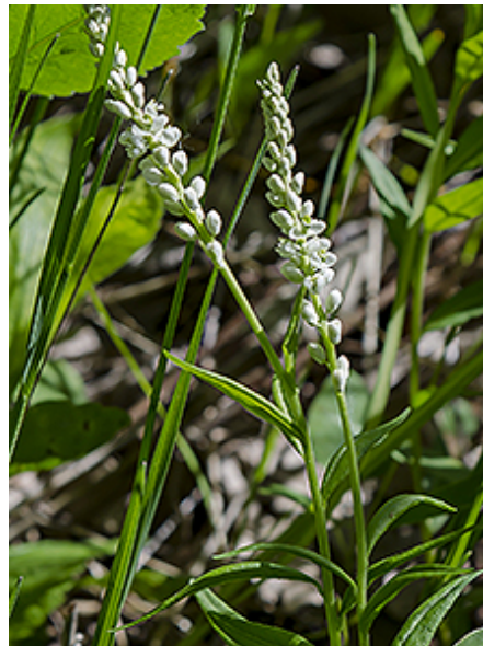
Seneca Snakeroot ( Polygala senega ).