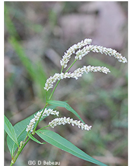
Nodding Smartweed , ( Persicaria lapathifolia ).