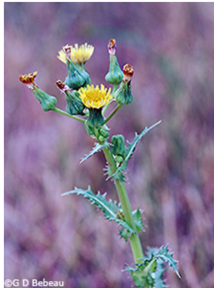
Spiny Sowthistle , ( Sonchus asper )..