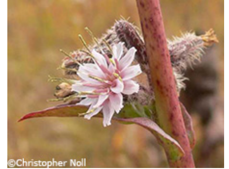
Purple Rattlesnake Root, ( Prenanthes racemosa ).