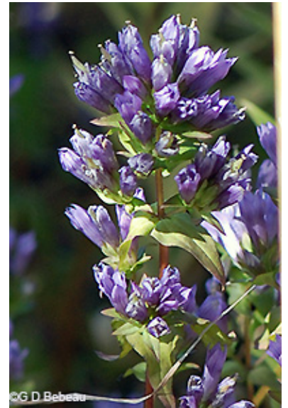
Ague-weed, Stiff Gentian ( Gentiana quinquefolia )