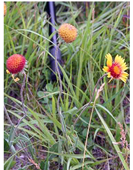
Blanketflower, ( Gaillardia aristata).