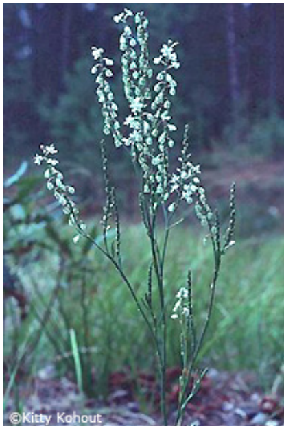
Coastal Jointweed, ( Polygonella articulata).