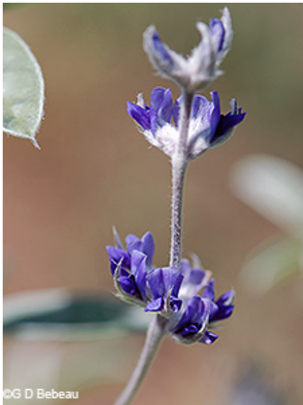
Silvery Scurfpea , ( Pediomelum argophyllum )