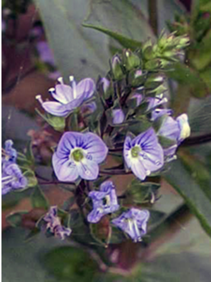
Water Speedwell ( Veronica anagallis-aquatica ).