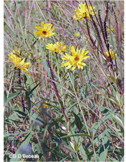
Stiff Sunflower . ( Helianthus pauciflorus )