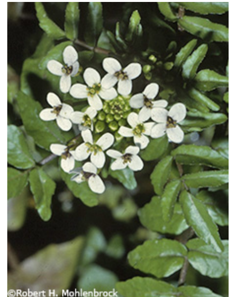
Watercress , ( Nasturtium officinale ).