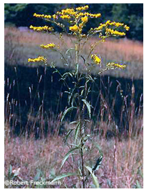
Early Goldenrod, ( Solidago juncea).