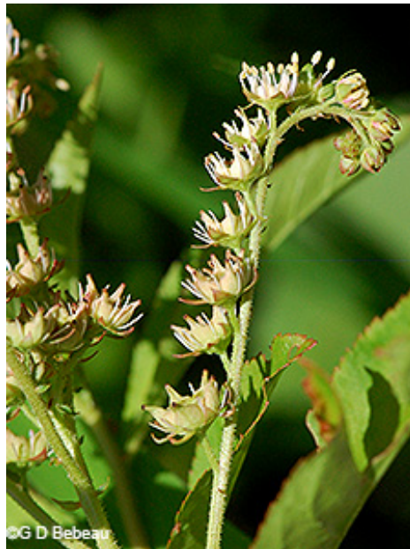
Ditch Stonecrop ( Penthorum sedoides ).