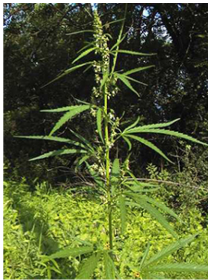
Hemp ( Cannabis sativa ).