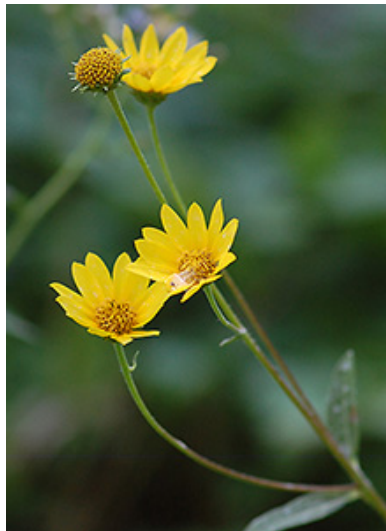
Fewleaf Sunflower , ( Helianthus occidentalis ).