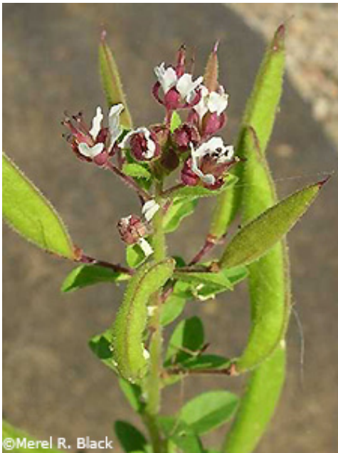
Roughseed Clammyweed, ( Polanisia dodecandra ).