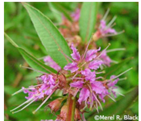
Swamp Loosestrife. ( Decodon verticillatus ).