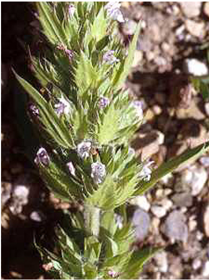
American Dragonhead ( Dracocephalum parviflorum).