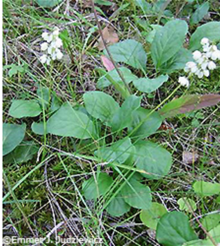
Wax-flower Shinleaf , ( Pyrola elliptica ).