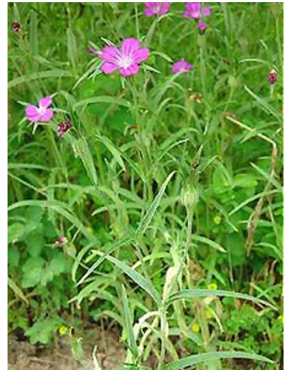
Corn Cockle ( Agrostemma githago ).