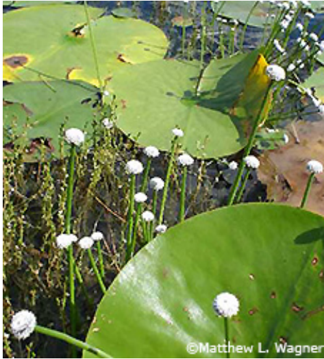
Seven-angle Pipewort ( Eriocaulon aquaticum ).