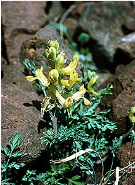
Golden Corydalis ( Corydalis aurea ).