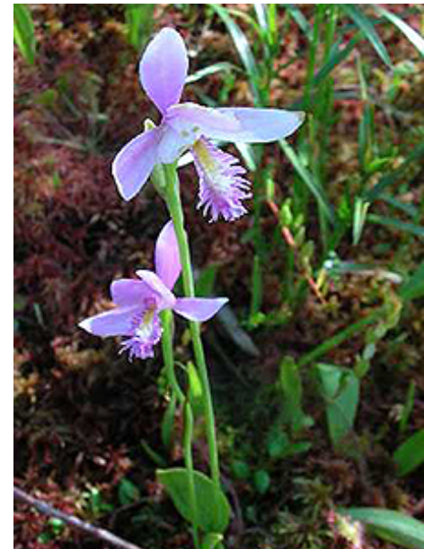
Rose Pogonia, ( Pogonia ophioglossiodes ). Photo ©Merle R. Black, Wisconsin Flora