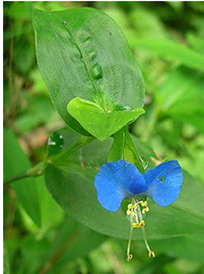
Asiatic Dayflower ( Commelina communis ).