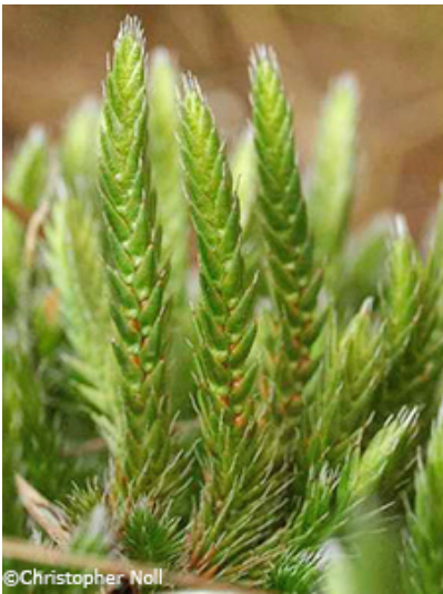
Dwarf Spike-moss , ( Selaginella rupestris ).