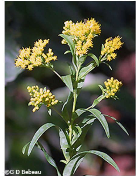
Riddell's Goldenrod , ( Solidago riddellii )