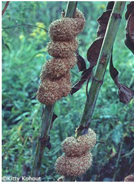
Rope Dodder, ( Cuscuta glomerata ).