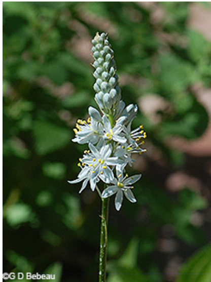
Atlantic Camas, Wild Hyacinth ( Camassia scilloides ).