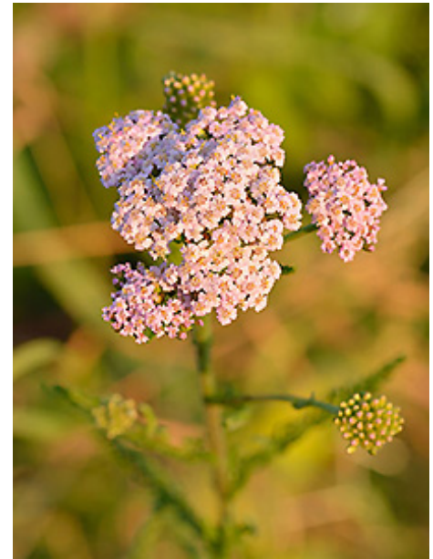
Pink Yarrow , ( Achillea millefolium roseum ), Photo © Ivar Leidus.