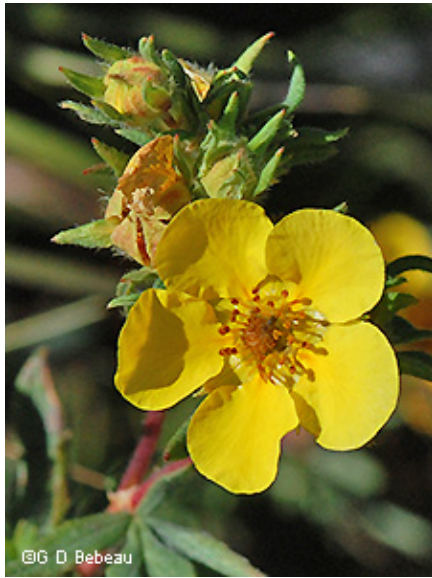
Shrubby Cinquefoil , ( Dasiphora fruticosa ).