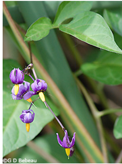
Climbing Nightshade, ( Solanum dulcamara )