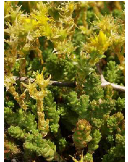
Goldmoss Stonecrop ( Sedum acre )