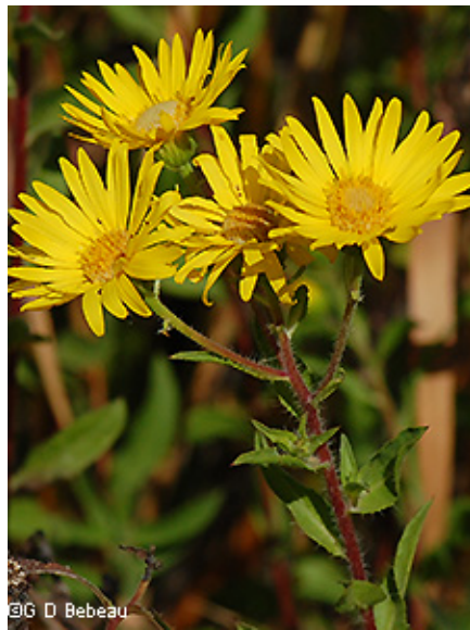
Hairy False Goldenaster ( Heterotheca villosa ).