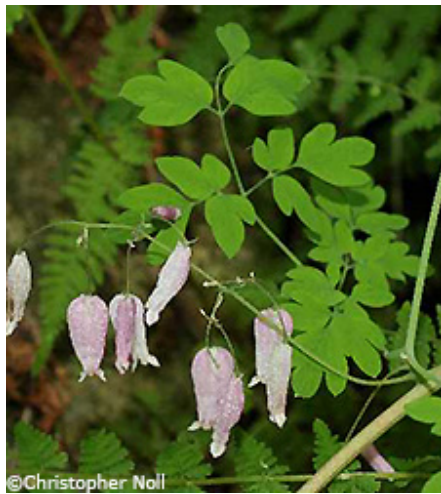
Allegheny Vine ( Adlumia fungosa).