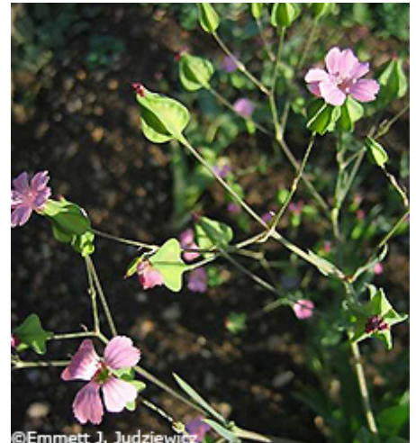
Cow Soapwort ( Vaccaria hispanica).