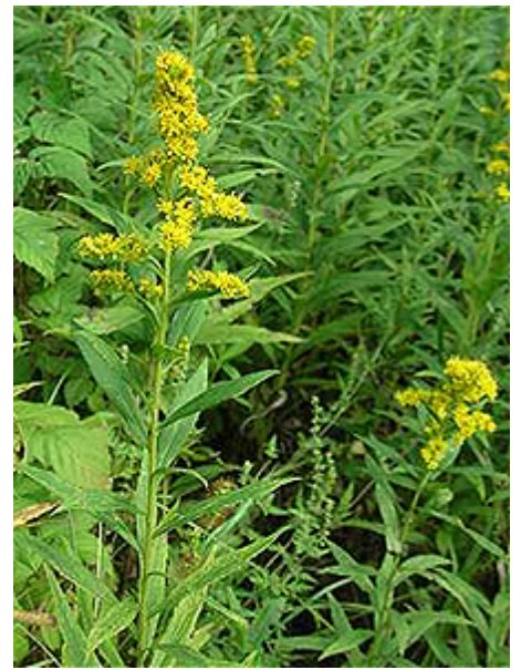
Missouri Goldenrod , ( Solidago missouriensis ).