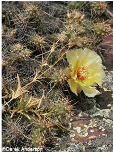
Brittle Prickly Pear ( Opuntia fragilis)