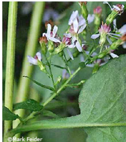
Drummond's Aster ( Symphotrichum drummondii).