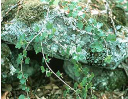
Canadian Gooseberry, ( Ribes oxycnathoides).