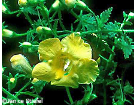
Fern-leaf False Foxglove ( Aureolaria pedicularia ).