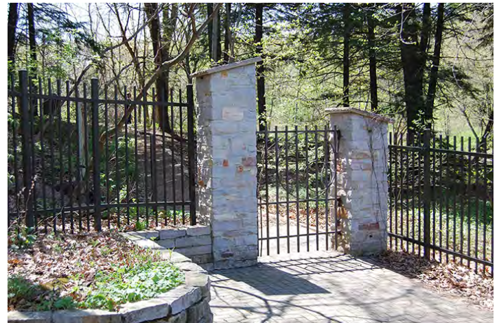
Front and back gate construction and iron work. Front gate 1990, back gate 1995-97