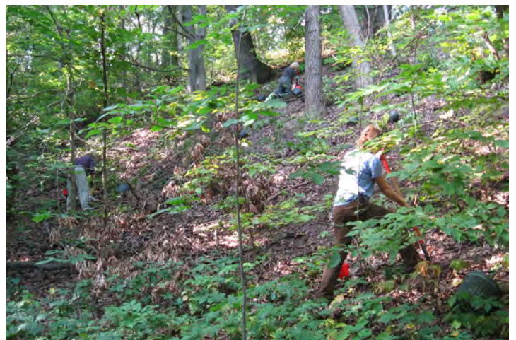
Ongoing - annually - Funding for new plants for the Garden $32,600 in the past 12 years.