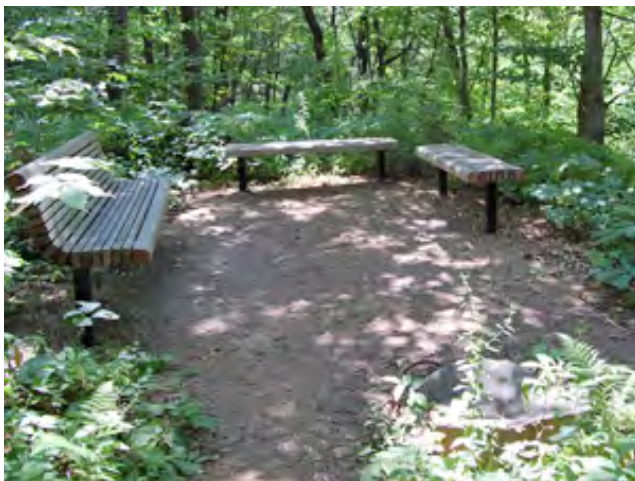
2005 - Avery Birding Terrace