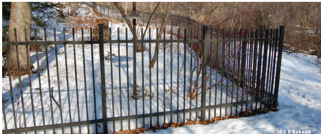
2005 - Wrought Iron fencing along back of Garden