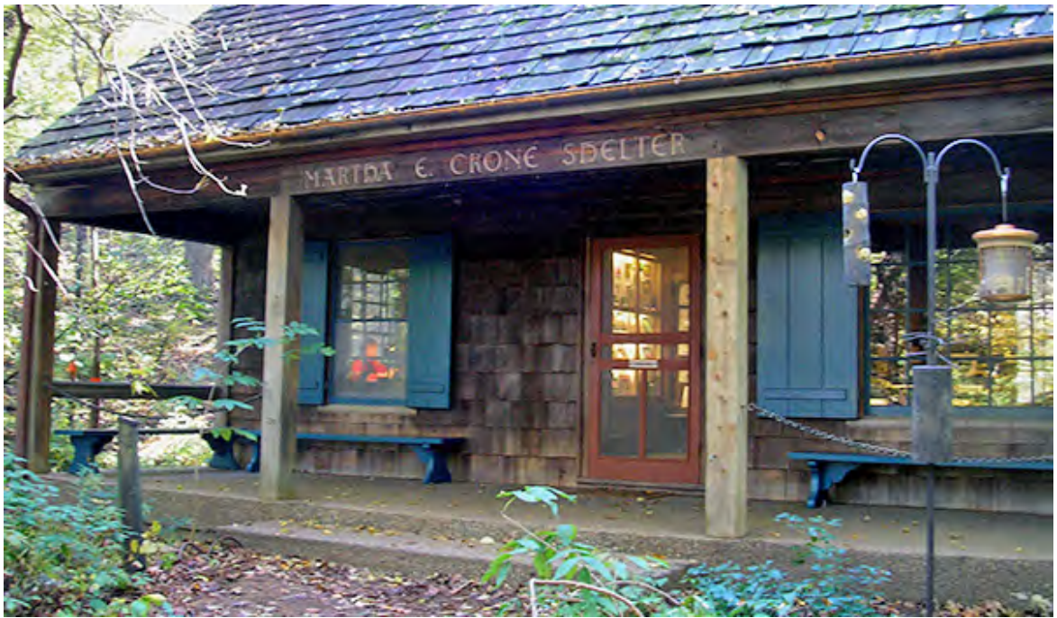
1969/70 Construction of the Martha Crone Shelter