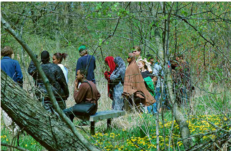
Ongoing - Annually - Transportation Grants for School Classes to visit the Garden. $19,500 since inception.