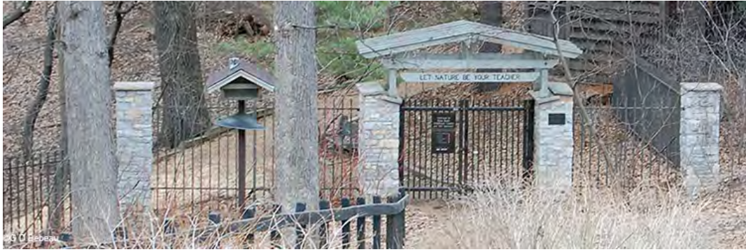
1995 - Wrought Iron Fencing along front of Garden