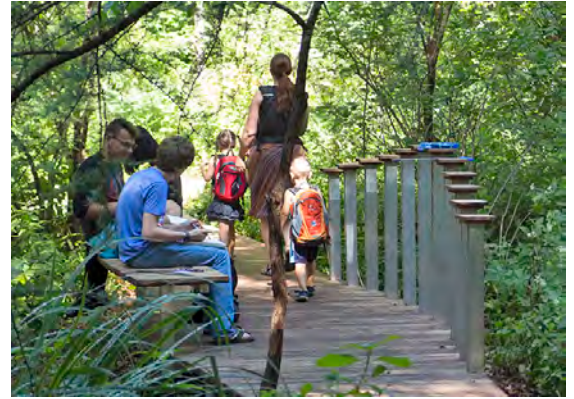
Left: 2019 Completion of the wetland boardwalk. Right: 2015 - Phase I of the wetland boardwalk A joint project with MPRB