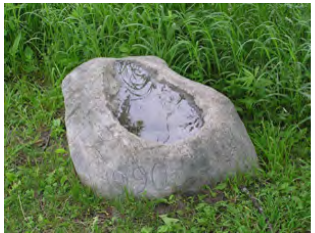
1990 - Sculpted Stone Birdbath